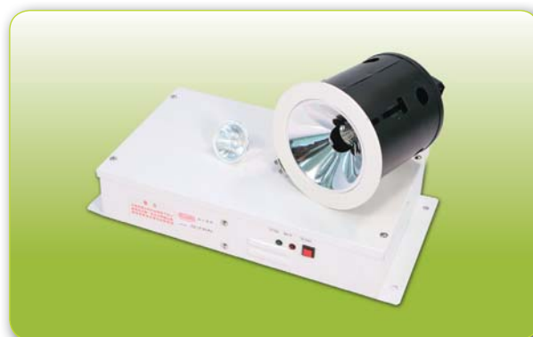
"CRYSTALITE" Cat. CC-12-50-K2

12V 50W Emergency Tungsten Halogen Lamp Power-Pack, with metal housing for 2 hours duration.